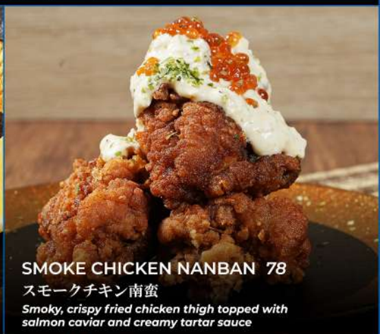
SMOKE CHICKEN NANBAN 78

Crispy wakame seaweed and burdock root tempura