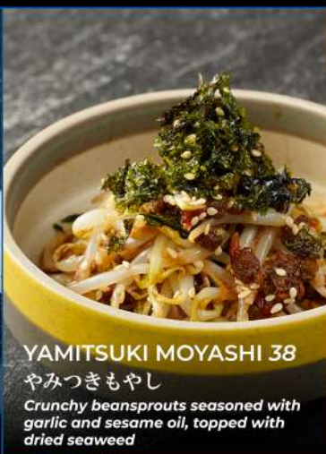
YAMITSUKI MOYASHI 38

Grilled harami beef skewers with pineapple