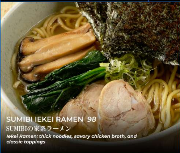
SUMIBI IEKEI RAMEN 98

Smoky, crispy fried chicken thigh topped with salmon caviar and creamy tartar sauce