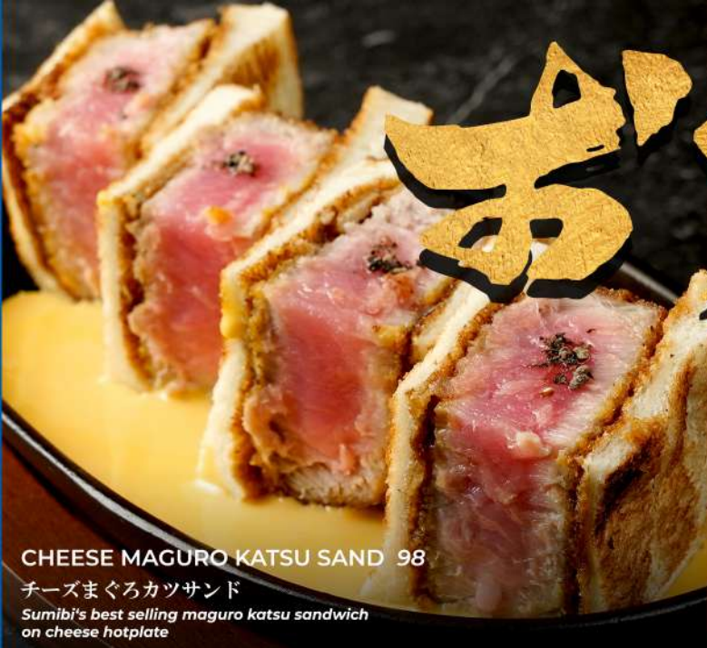
CHEESE MAGURO KATSU SAND 98