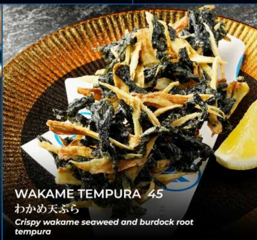
WAKAME TEMPURA 45

Grilled tender Japanese wagyu with mashed potato