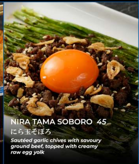
NIRA TAMA SOBORO 45

Crispy breaded mushroom stuffed with mozzarella