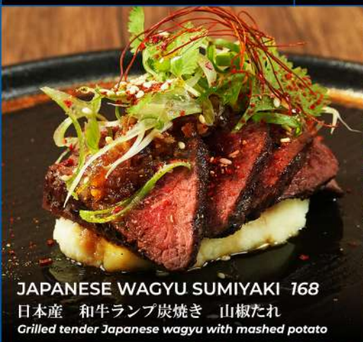
JAPANESE WAGYU SUMIYAKI 168

Grilled Japanese chicken meatball glazed with yakitori sauce, served with your choice of egg yolk, cheese, or grated daikon.