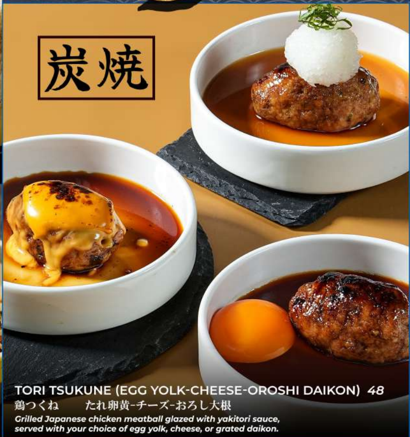
TORI TSUKUNE (EGG YOLK-CHEESE-OROSHI DAIKON) 48

Crunchy beansprouts seasoned with garlic and sesame oil, topped with dried seaweed