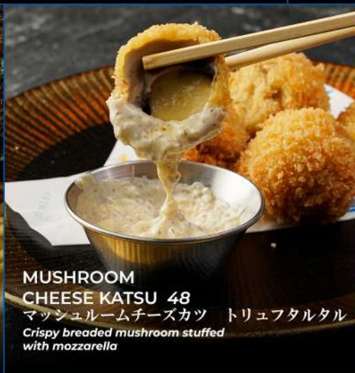
MUSHROOM CHEESE KATSU 48

Iekei Ramen: thick noodles, savory chicken broth, and classic toppings