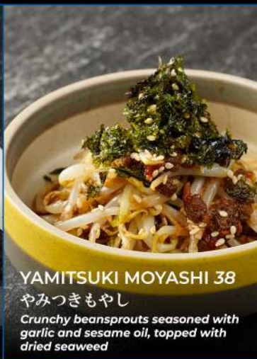
YAMITSUKI MOYASHI 38

Grilled harami beef skewers with pineapple