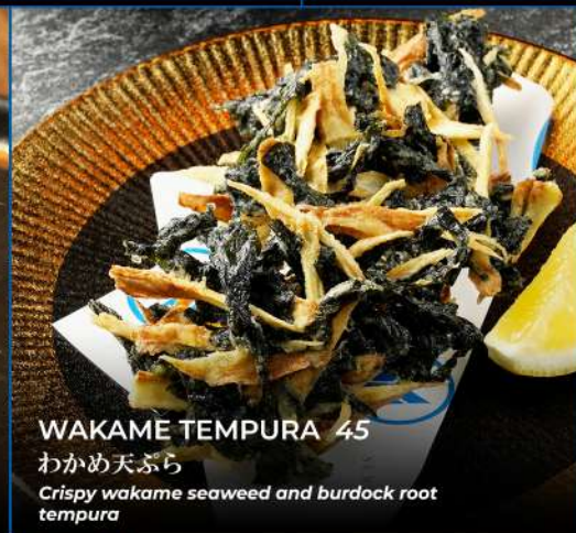
WAKAME TEMPURA 45

Grilled tender Japanese wagyu with mashed potato