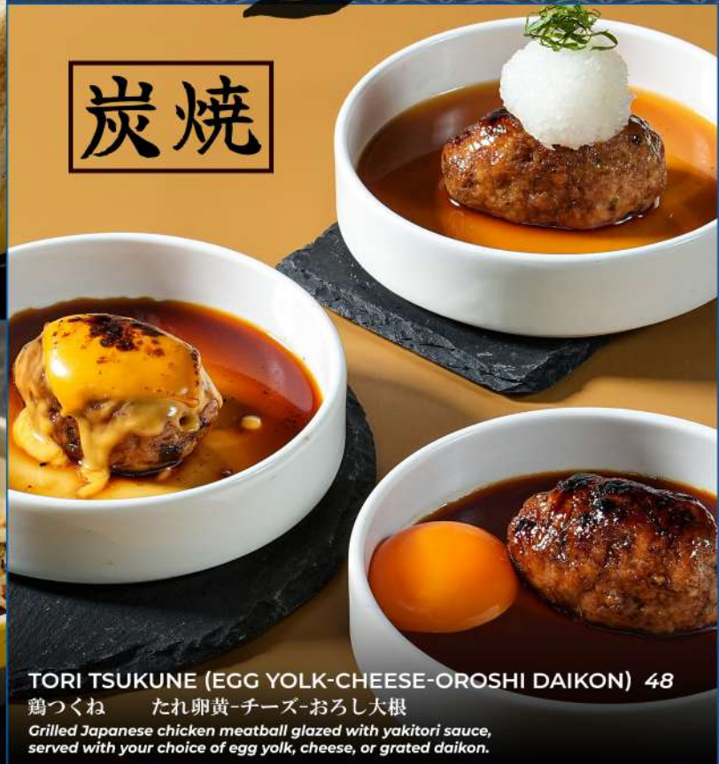
TORI TSUKUNE (EGG YOLK-CHEESE-OROSHI DAIKON) 48

Crunchy beansprouts seasoned with garlic and sesame oil, topped with dried seaweed