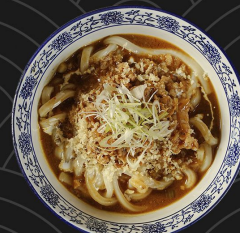
GYU CURRY SOBA / UDON 108

ジャンボ海老天カレー 蕎麦 / うどん Crispy ebi tempura served in curry sauce, with soba or udon