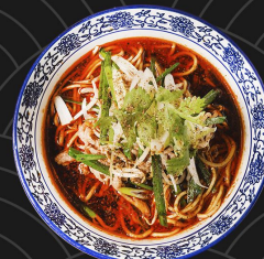
GYU MALA MEN 108 牛麻辣麺

Ramen with minced beef in spicy sesame soup