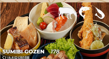
SUMIBI GOZEN 178

サーモン照焼 Grilled salmon and rice, served with a side of salad, miso soup, pickles and kobachi