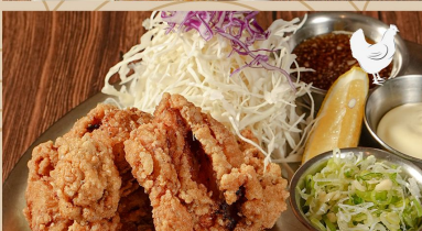
TORI KARAAGE 95

鯖ねぎ塩焼き明太子 Grilled saba and rice, served with a side of salad, miso soup, pickles and kobachi