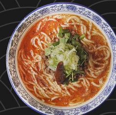
TAN TAN MEN 95 坦々麺

北海道味噌ラーメン Ramen with chicken, egg, in thick miso soup