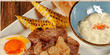
MAGURO NEGIYAKI TARTAR 108

Include Rice, Appetizer, Salad, Miso Soup, Pickles