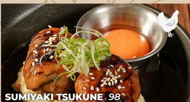
SUMIYAKI TSUKUNE 98

鶏唐揚げ Japanese crispy, golden fried chicken