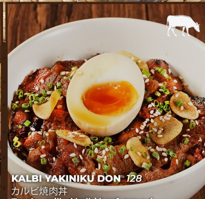
KALBI YAKINIKU DON 128

うなぎ天丼 Crispy eel tempura with sweet-glazed sauce over rice