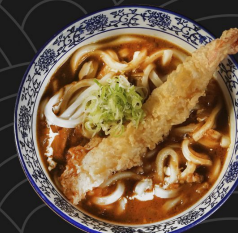
JUMBO EBITEN CURRY SOBA / UDON 128

Ramen with chicken chasu and dumpling in soy-based broth infused with fresh ginger