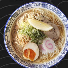
YUZU SHIO RAMEN 95 柚子塩ラーメン

Ramen with chicken, egg in umami yuzu soup