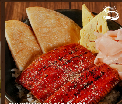
SUMIYAKI UNAGI DON 138

ジャンボ海老天丼 Crispy jumbo shrimp tempura with a rich egg yolk, served over rice and topped with ikura