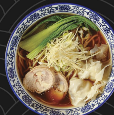
SHOGA RAMEN 98 生姜ラーメン

Ramen with chicken chasu and dumpling in soy-based broth infused with fresh ginger