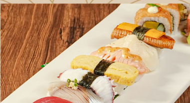
NIGIRI SUSHI 128

まぐろかま焼き Grilled tuna collar with savoury gravy topped with negi