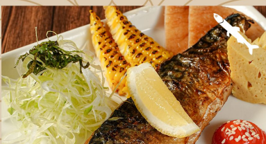
SABA NEGISHIO YAKI MENTAICO 98

まぐろ葱焼きタルタル Grilled tuna and rice, served with a side of salad, miso soup, pickles and kobachi