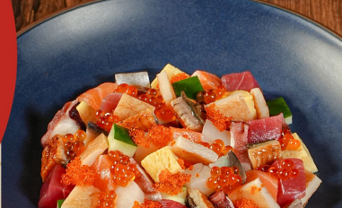
BARA CHIRASHI DON 138

炭焼きつくね Grilled chicken meatballs on creamy mashed potatoes, glazed with a special yakitori sauce.