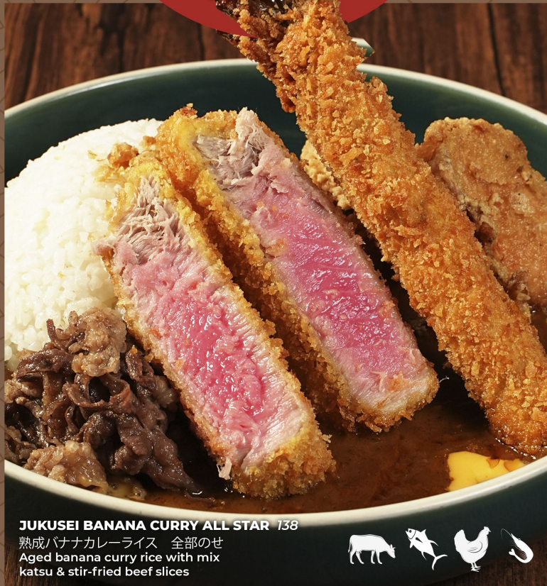
JUKUSEI BANANA CURRY ALL STAR 138

Include Appetizer, Salad, Miso Soup, Pickles