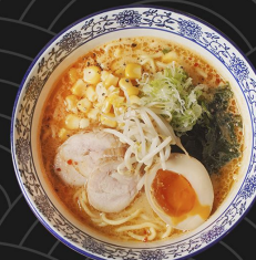
HOKKAIDO MISO RAMEN 95

Dry ramen with minced beef, bean sprouts, peanuts, egg yolk in original sesame sauce