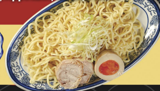
TAN TAN TSUKE MEN 98

Ramen with tender duck and green onions in umami rich soup