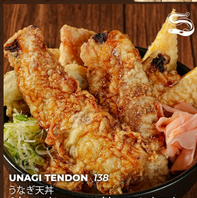
UNAGI TENDON 138

いくらサーモン丼、天バラ丼、焼肉丼 Three mini dons: Fresh salmon & ikura, savory grilled kalbi, and crispy ebi tempura