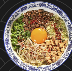
TAN TAN MAZE SOBA 95 坦々まぜそば

Ramen with chicken, egg in umami yuzu soup