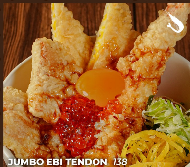
JUMBO EBI TENDON 138

カルビ焼肉丼 Tender grilled kalbi beef, served over rice with umami-rich egg