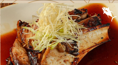
MAGURO KAMA YAKI 138

SUMIBI御膳 5-Kinds Lunch Set Beef sirloin steak, salmon teriyaki, assorted sashimi, prawn tempura, and karaage, served with rice