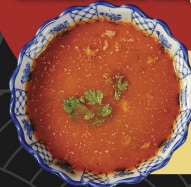
KAMO PAITAN MEN 108

Half Chahan 30 半炒飯 Japanese style fried rice Ocha (Hot/Ice) 10 Coffee (Hot/Ice) 18