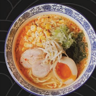
HOKKAIDO MISO RAMEN 90

Ramen with chicken dumplings in soy soup