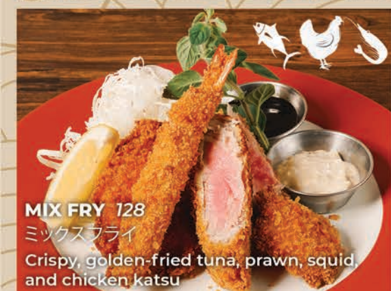
MIX FRY 128

鶏唐揚げ Japanese crispy, golden fried chicken