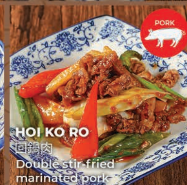
HOI KO RO

海老チリ Fried shrimp in slightly spicy chili sauce