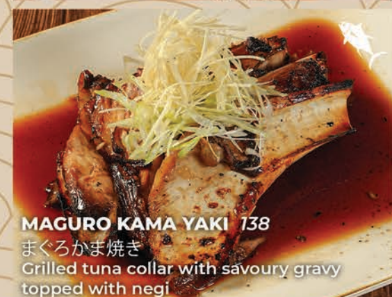
MAGURO KAMA YAKI 138

サーモン兜焼 (塩焼き、照り焼き、スパイシーマヨ焼き) Grilled Salmon Head (Choices: Shioyaki, Teriyaki, Spicy Mayo)