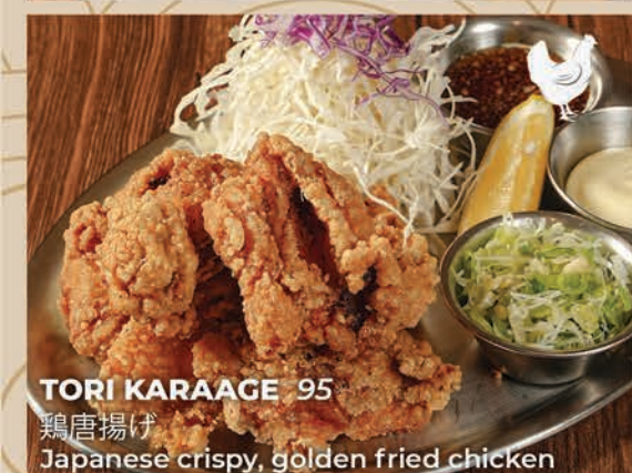
TORI KARAAGE 95

鶏唐揚げ Japanese crispy, golden fried chicken