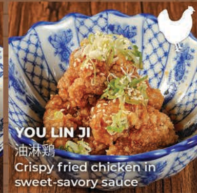
YOU LIN JI

酢鶏 Crispy chicken in a tangy sweet and sour sauce