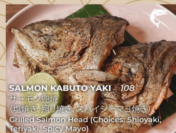
SALMON KABUTO YAKI 108

サーモン兜焼 (塩焼き、照り焼き、スパイシーマヨ焼き) Grilled Salmon Head (Choices: Shioyaki, Teriyaki, Spicy Mayo)