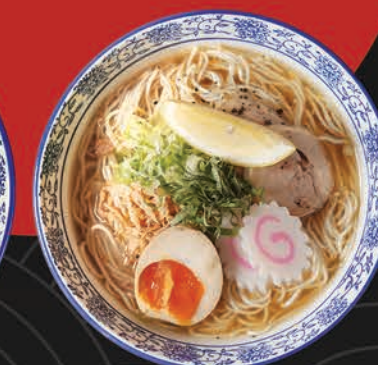
YUZU SHIO RAMEN 90

Ramen with chicken chasu and dumpling in soy-based broth infused with fresh ginger