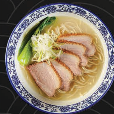
KAMO PAITAN MEN 108

Ramen with scallops, prawn and squid in rich umami broth