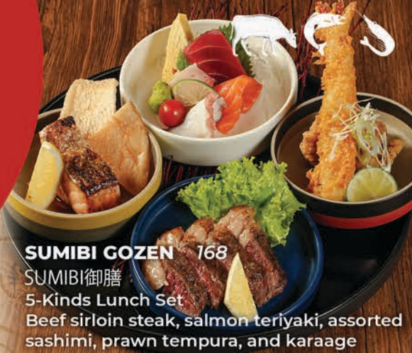
SUMIBI GOZEN 168

Include Rice, Appetizer, Salad, Miso Soup, Pickles