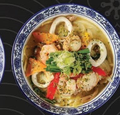
KAISEN TANMEN 98

Ramen with minced beef in spicy sesame soup