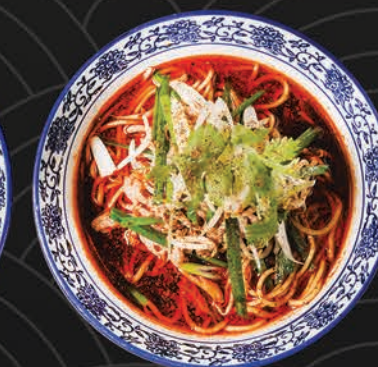
GYU MALA MEN 108

Ramen with tender duck and green onions in umami rich soup