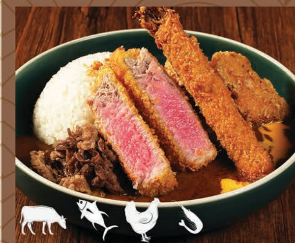
JUKUSEI BANANA CURRY ALL STAR 138

Include Appetizer, Salad, Miso Soup, Pickles