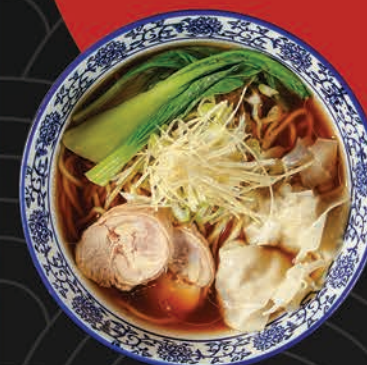
SHOJA RAMEN 98

Include Sushi Roll, Appetizer, Salad, Pickles