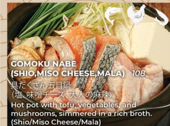
GOMOKU NABE (SHIO, MISO CHEESE, MALA) 108

Beef sirloin steak, salmon teriyaki, assorted sashimi, prawn tempura, and karaage