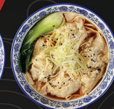
WONTON MEN 98

Ramen with chicken, egg in umami yuzu soup