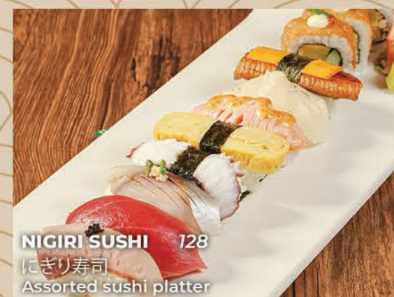
NIGIRI SUSHI 128

まぐろかま焼き Grilled tuna collar with savoury gravy topped with negi