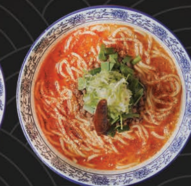
TAN TAN MEN 90

Ramen with chicken, egg, in thick miso soup