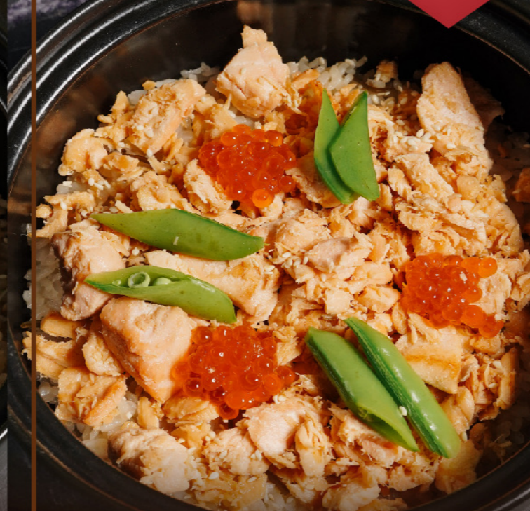
SALMON IKURA HOTPOT RICE サーモンといくら 土鍋飯 Salmon & Salmon Caviar 210