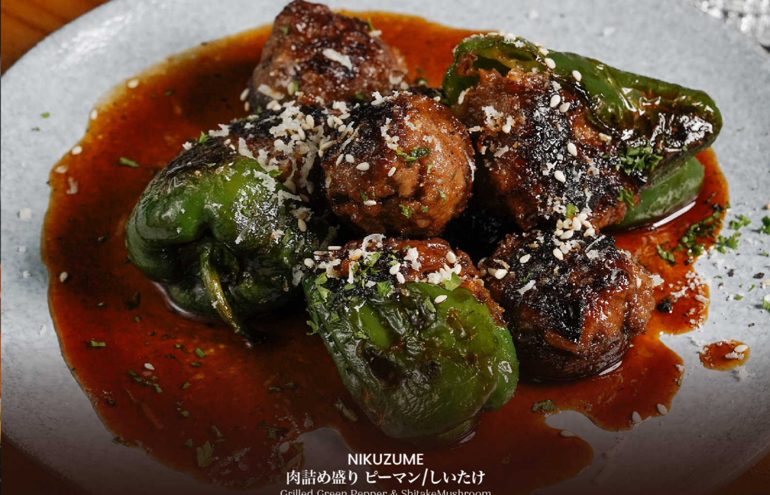
NIKUZUME 肉詰め盛り ピーマン/しいたけ Grilled Green Pepper & Shitake Mushroom Stuffed with Chicken Meatball 80