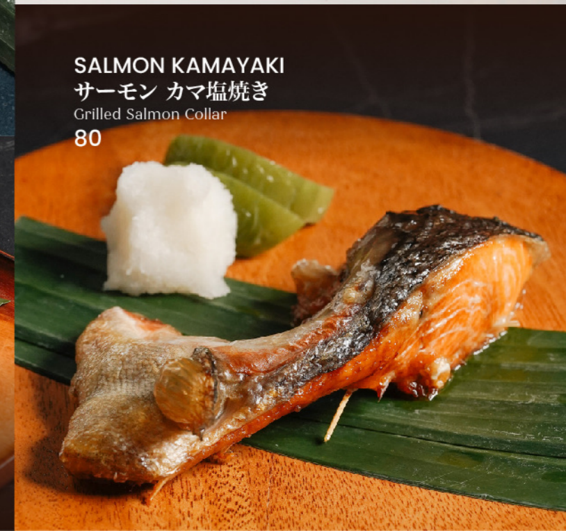
SALMON KAMAYAKI サーモン カマ塩焼き Grilled Salmon Collar 80