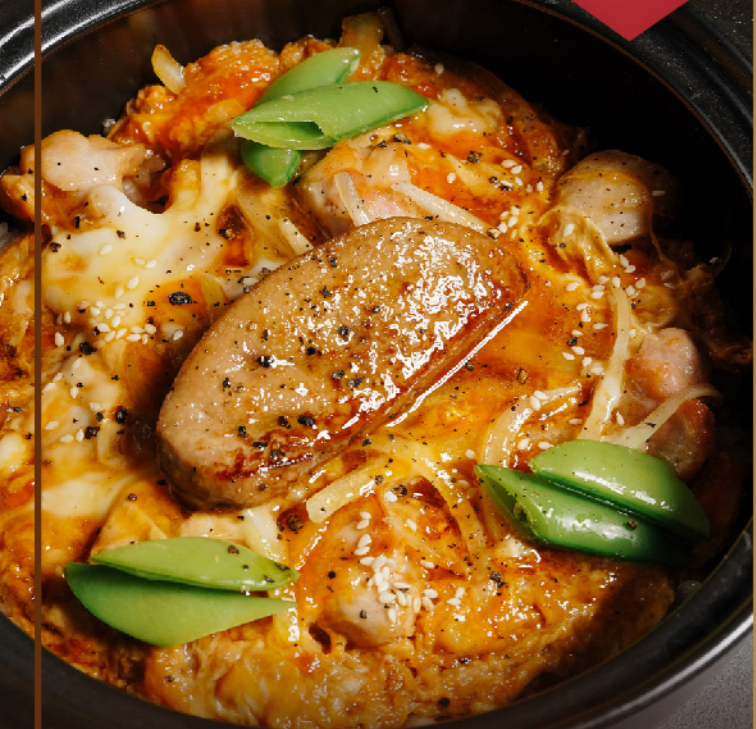
FOIEGRAS OYAKO DON HOTPOT RICE フォアグラ親子丼 土鍋飯 Foie Gras, Chicken & Egg 250