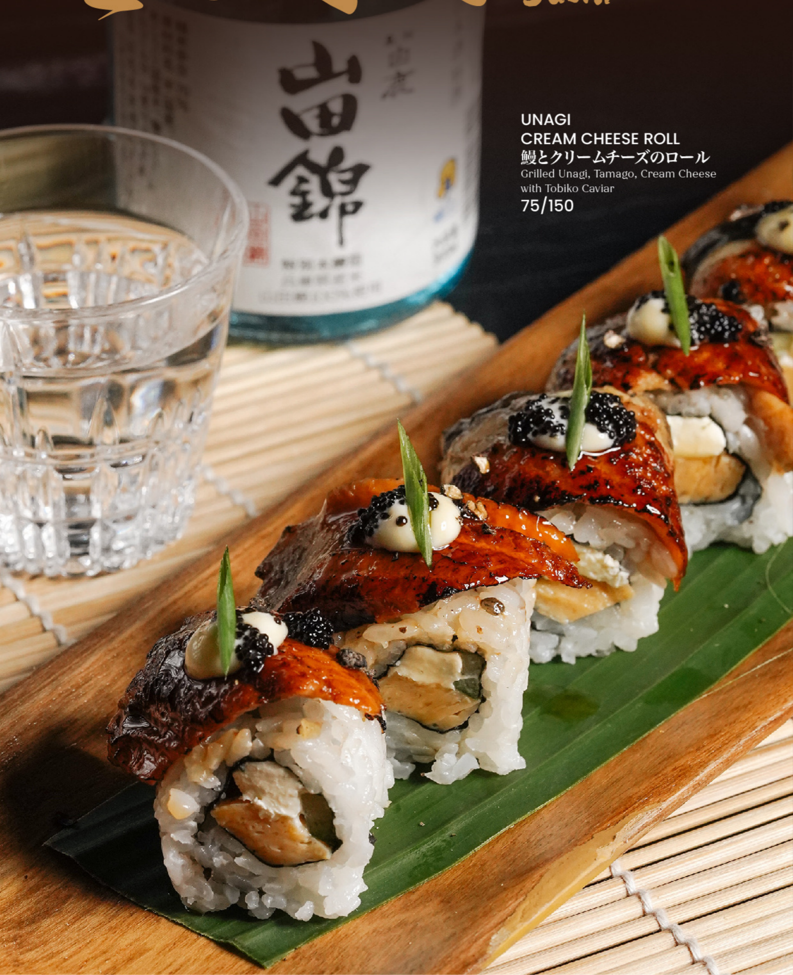
UNAGI CREAM CHEESE ROLL 鰻とクリームチーズのロール Grilled Unagi, Tamago, Cream Cheese with Tobiko Caviar 75/150