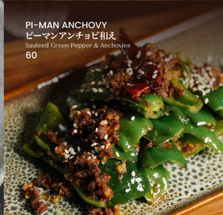
PI-MAN ANCHOVY ピーマンアンチョビ和え Sauteed Green Pepper & Anchovies 60