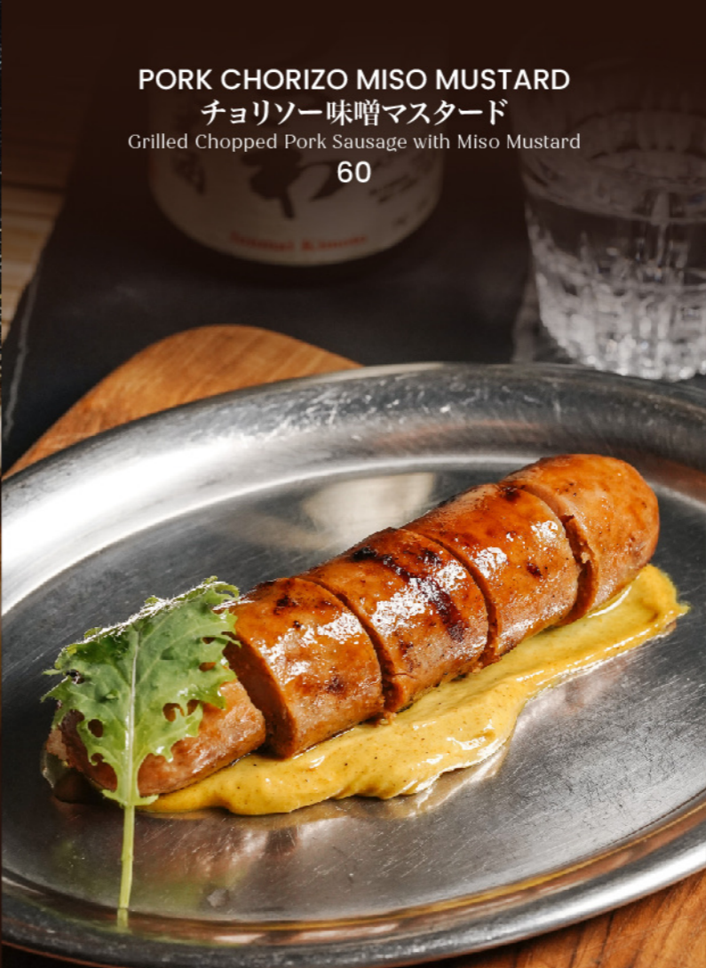
PORK CHORIZO MISO MUSTARD チョリソー味噌マスタード Grilled Chopped Pork Sausage with Miso Mustard 60