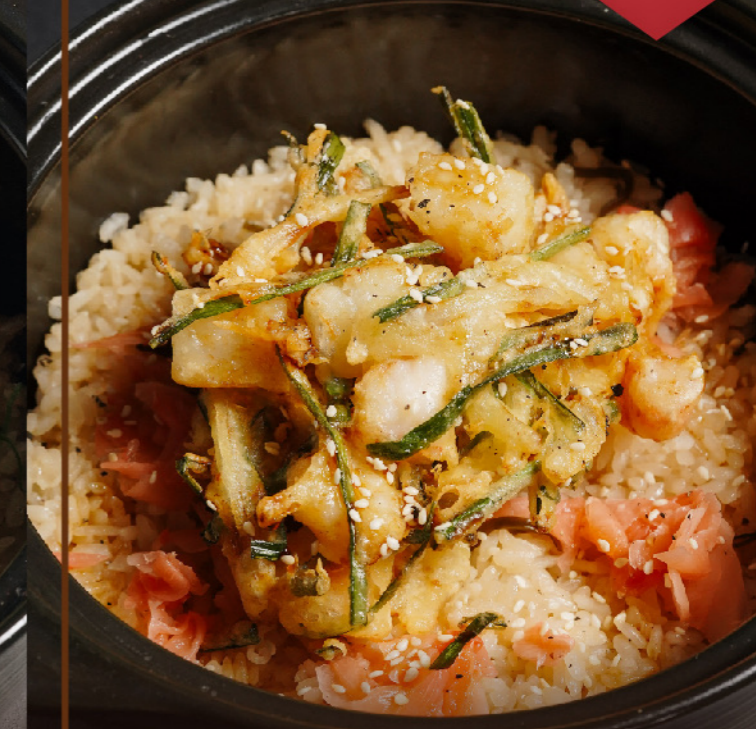
EBI HOTATE KAKIAGE HOTPOT RICE 小海老とほたてのかき揚げ 土鍋飯 Shrimp & Scallop Tempura 220