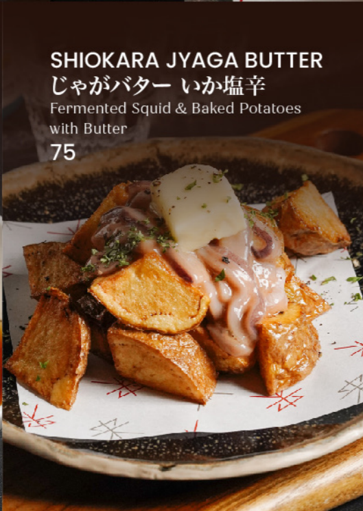
SHIOKARA JYAGA BUTTER じゃがバター いか塩辛 Fermented Squid & Baked Potatoes with Butter 75