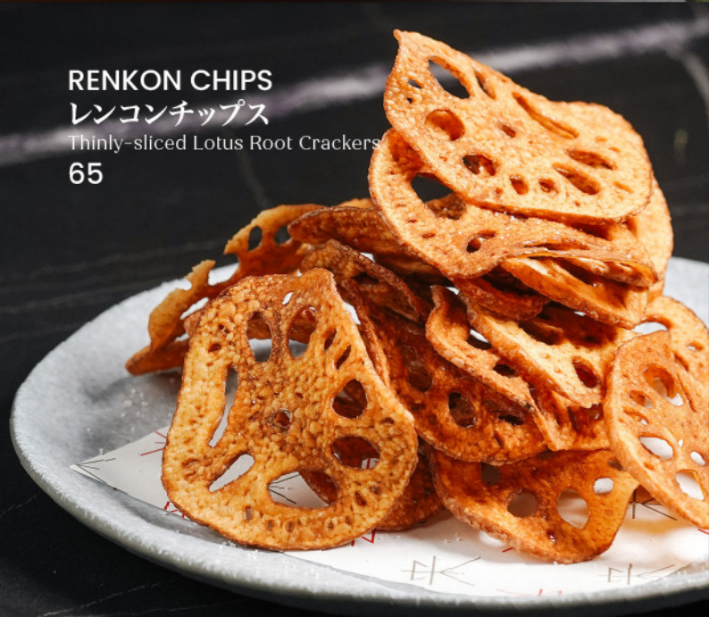
RENKON CHIPS レンコンチップス Thinly-sliced Lotus Root Crackers 65