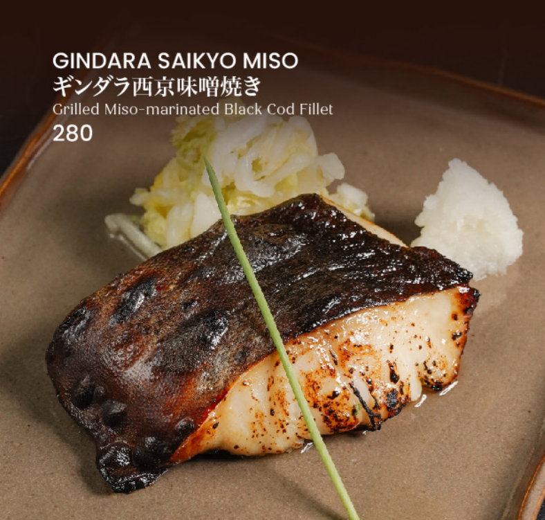
GINDARA SAIKYO MISO ギンダラ西京味噌焼き Grilled Miso-marinated Black Cod Fillet 280