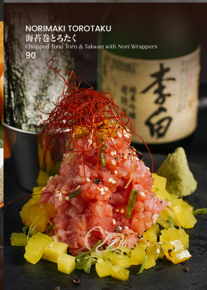
NORIMAKI TOROTAKU 海苔巻とろたく Chopped Tuna Toro & Takwan with Nori Wrappers 90