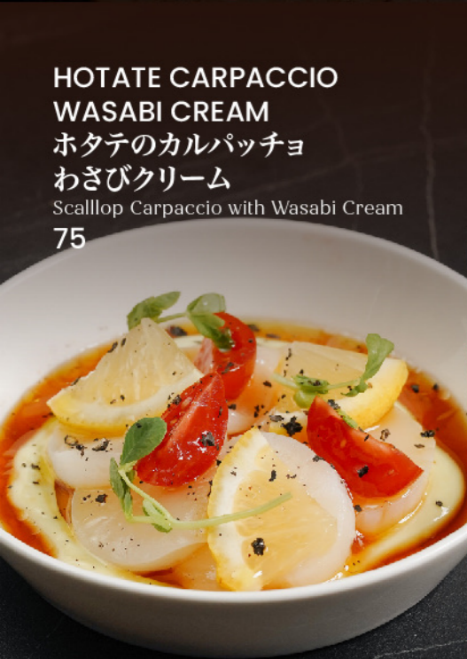
HOTATE CARPACCIO WASABI CREAM ホタテのカルパッチョ わさびクリーム Scallop Carpaccio with Wasabi Cream 75