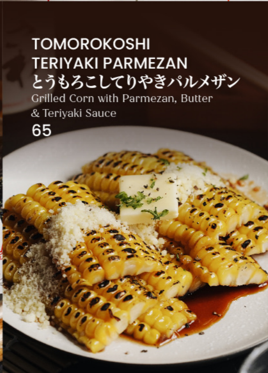
TOMOROKOSHI TERIYAKI PARMEZAN とうもろこし 焼パルメザン Grilled Corn with Parmezan, Butter & Teriyaki Sauce 65