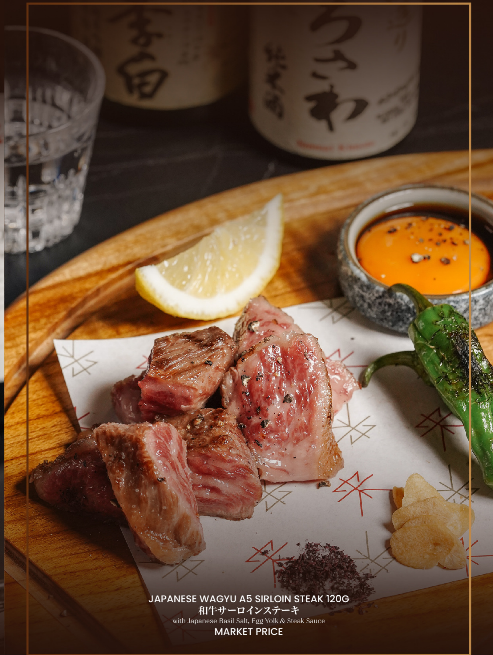
JAPANESE WAGYU A5 SIRLOIN STEAK 120G 和牛サーロインステーキ with Japanese Basil Salt, Egg Yolk & Steak Sauce MARKET PRICE