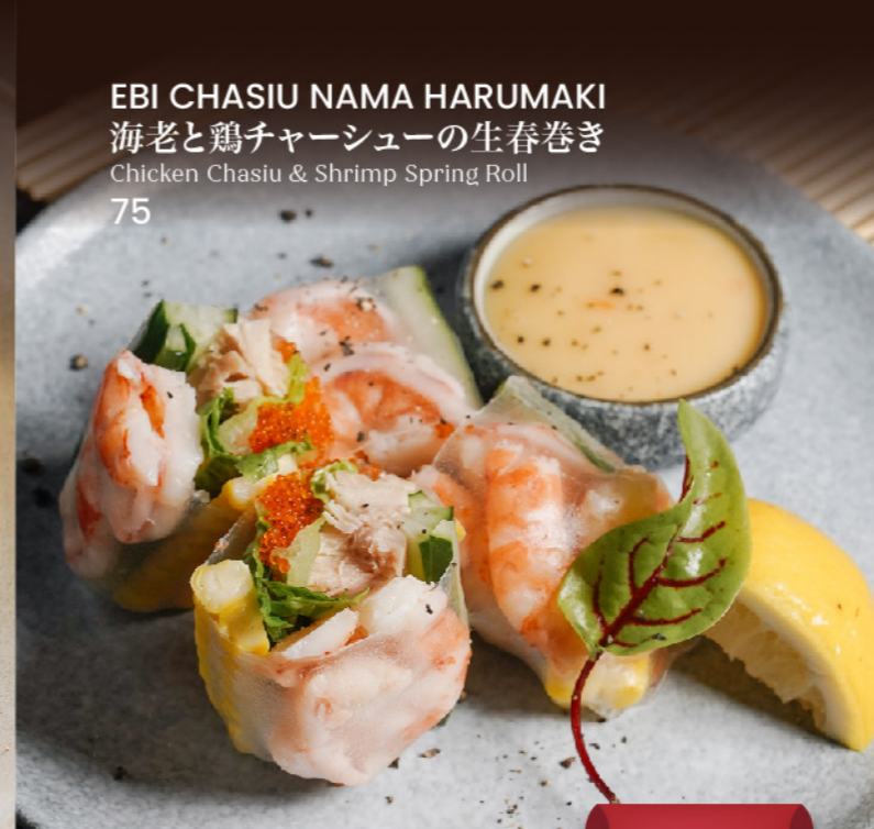
EBI CHASIU NAMA HARUMAKI 海老と鶏チャーシューの生春巻き Chicken Chasiu & Shrimp Spring Roll 75