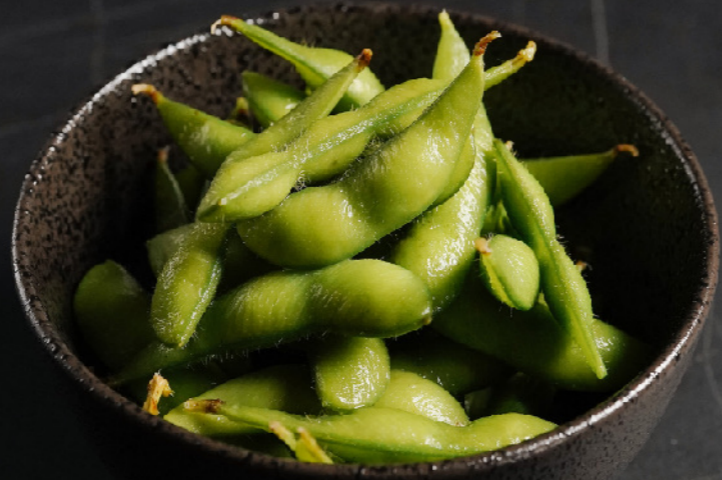
EDAMAME 枝豆 Green Beans 50