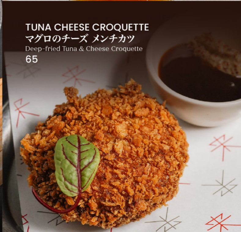
TUNA CHEESE CROQUETTE マグロのチーズ メンチカツ Deep-fried Tuna & Cheese Croquette 65