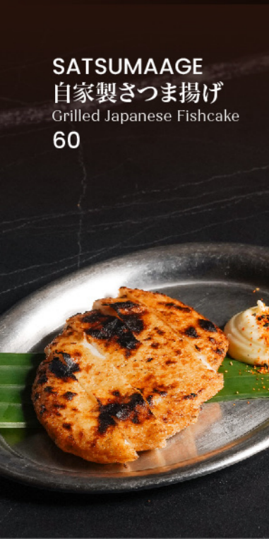
SATSUMAAGE 自家製さつま揚げ Grilled Japanese Fishcake 60