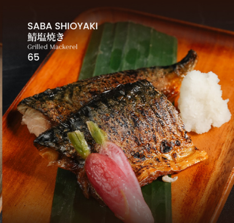
SABA SHIOYAKI 鯖塩焼き Grilled Mackerel 65