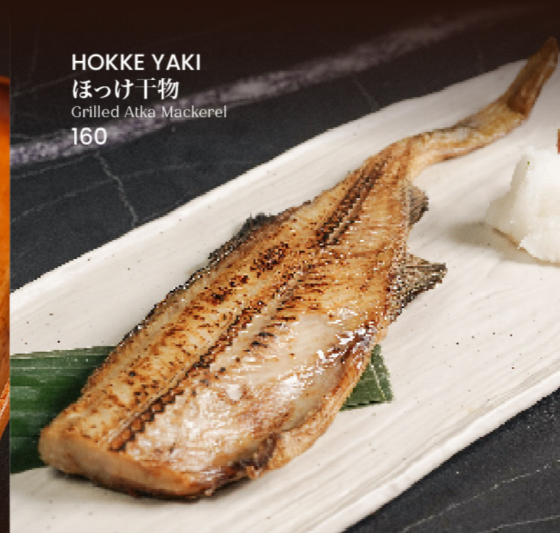
HOKKE YAKI ほっけ干物 Grilled Atka Mackerel 160