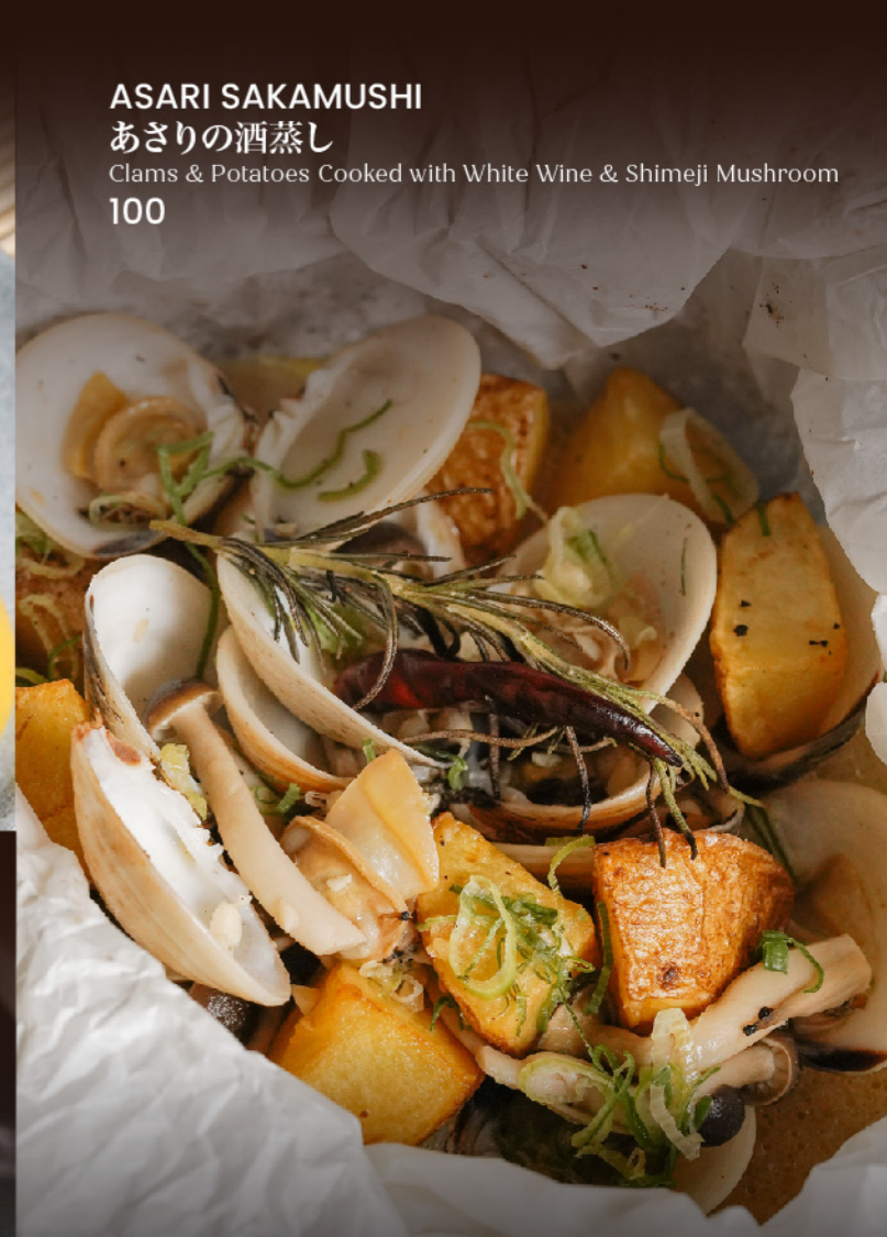
ASARI SAKAMUSHI あさりの酒蒸し Clams & Potatoes Cooked with White Wine & Shimeji Mushroom 100