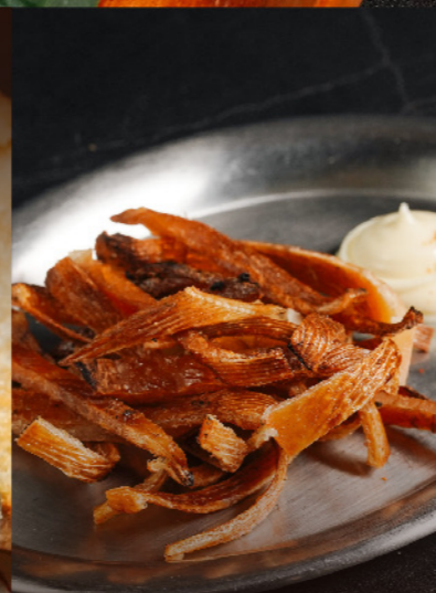
EIHIRE エイヒレ Dried Stingray Fins 95