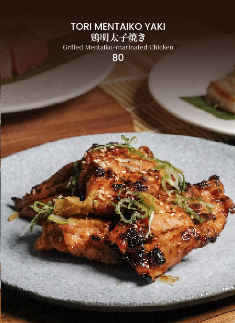
TORI MENTAIKO YAKI 鶏明太子焼き Grilled Mentaiko-marinated Chicken 80