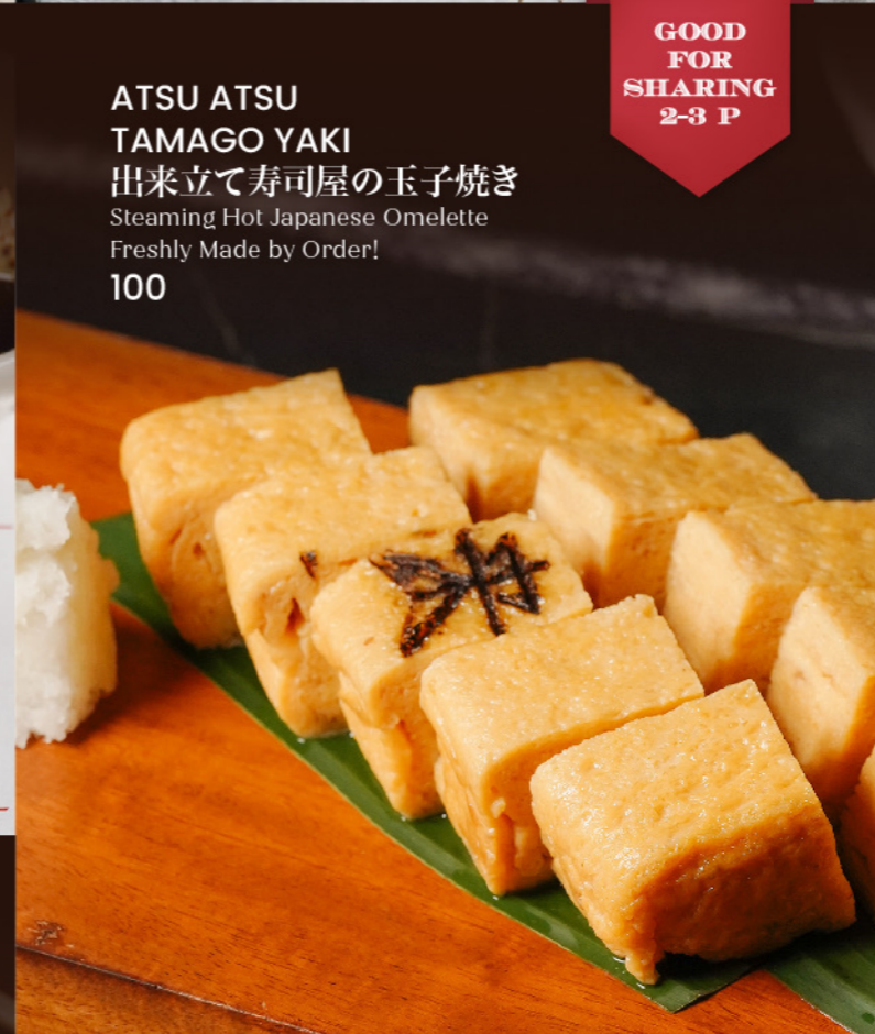
ATSU ATSU TAMAGO YAKI 出来立て寿司屋の玉子焼き Steaming Hot Japanese Omelette Freshly Made by Order! 100