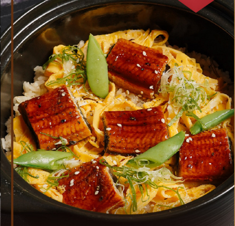
UNAGI HOTPOT RICE 鰻 土鍋飯 Unagi & Shredded Egg 220