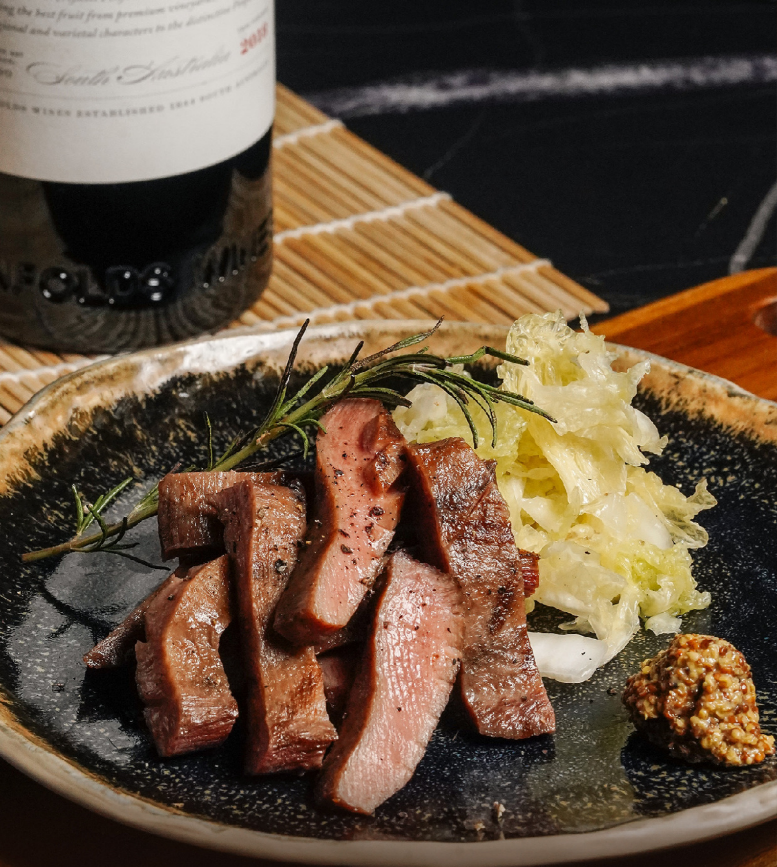
GYUTAN 厚切り牛タン焼き Thick Slices of Grilled Beef Tongue 130