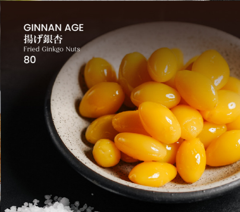
GINNAN AGE 揚げ銀杏 Fried Ginkgo Nuts 80