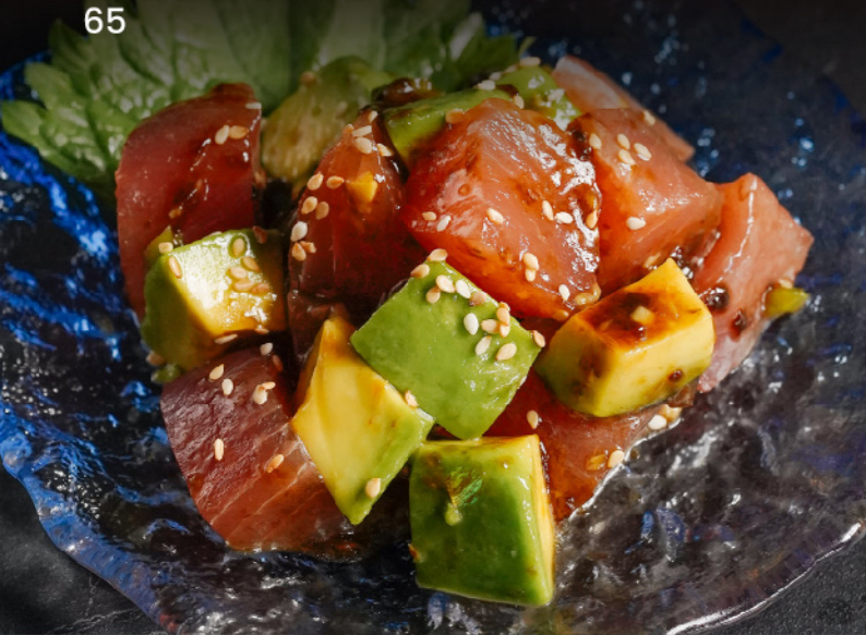
MAGURO AVOCADO NORI WASABI まぐろとアボカド 海苔ワサビ和え Tuna & Avocado with Nori Wasabi Dressing 65