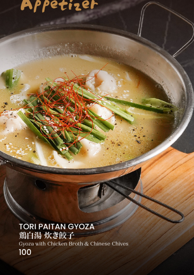
TORI PAITAN GYOZA 鶏白湯 炊き餃子 Gyoza with Chicken Broth & Chinese Chives 100