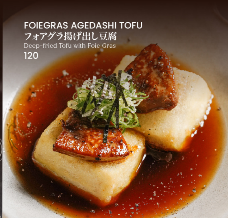
FOIEGRAS AGEDASHI TOFU フォアグラ揚げ出し豆腐 Deep-fried Tofu with Foie Gras 120