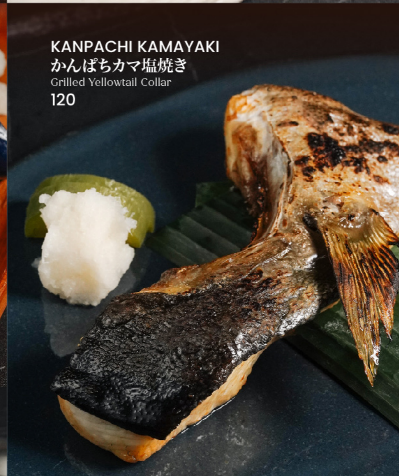
KANPACHI KAMAYAKI かんぱちカマ塩焼き Grilled Yellowtail Collar 120