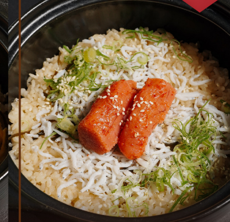
MENTAIKO SHIRASU HOTPOT RICE 明太子しらす 土鍋飯 Spicy Cod Roe & Dried Whitebait Fish 180