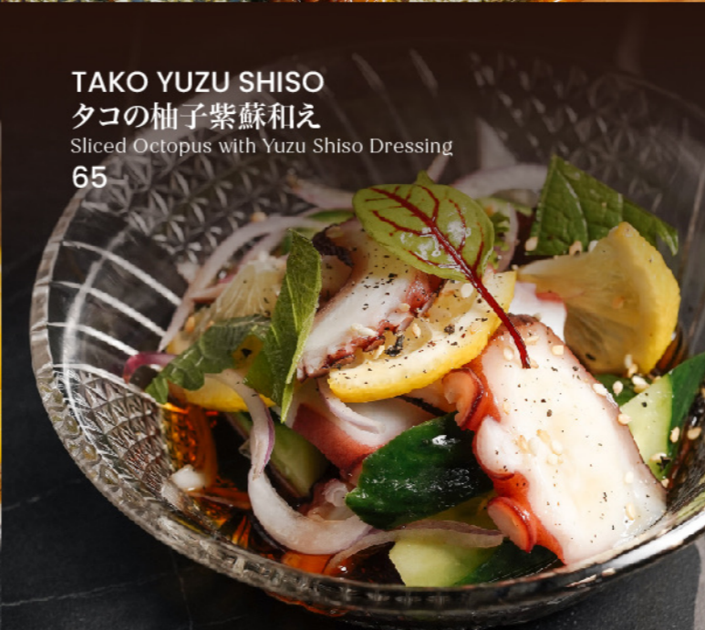
TAKO YUZU SHISO タコの柚子紫蘇和え Sliced Octopus with Yuzu Shiso Dressing 65