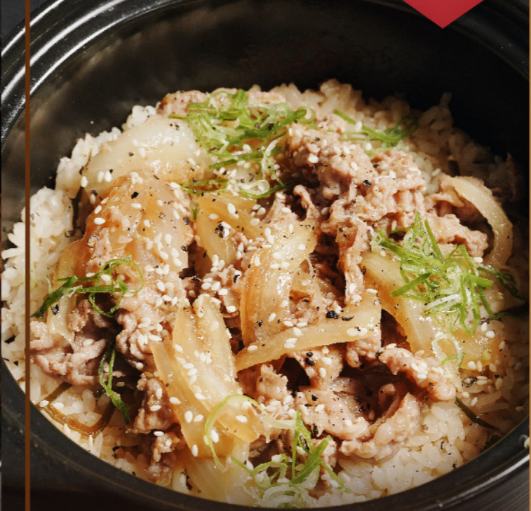
PORK GINGER HOTPOT RICE 豚生姜焼き 土鍋飯 Ginger-Marinated Pork Slices 220