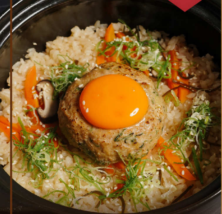
TSUKUNE HOTPOT RICE 鶏つくね 土鍋飯 Chicken Meatball & Egg 190