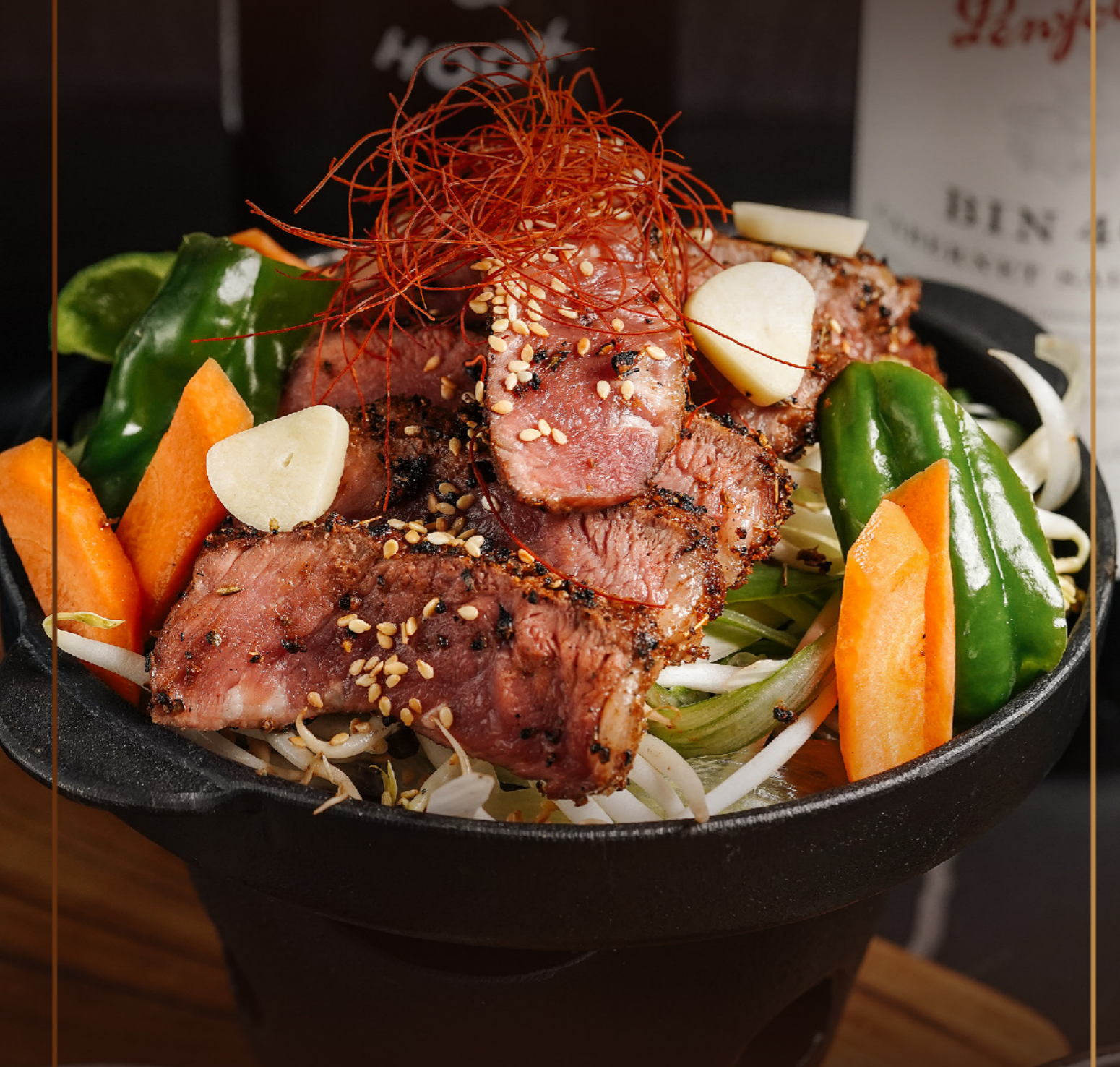
TEPPAN IZAKAYA STEAK 200G 鉄板ガーリックステーキ Grilled Sirloin Steak with Assorted Vegetables 320