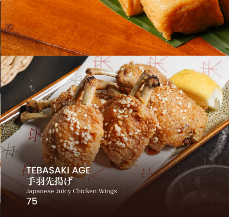
TEBASAKI AGE 手羽先揚げ Japanese Juicy Chicken Wings 75