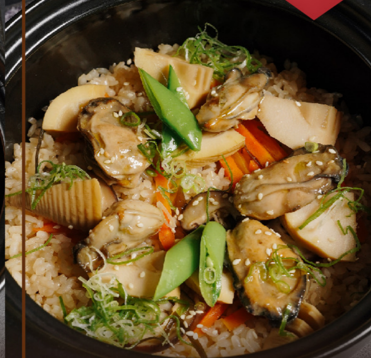
OYSTER HOTPOT RICE 牡蠣と筍 土鍋飯 Japanese Oysters & Bambooshoots 230