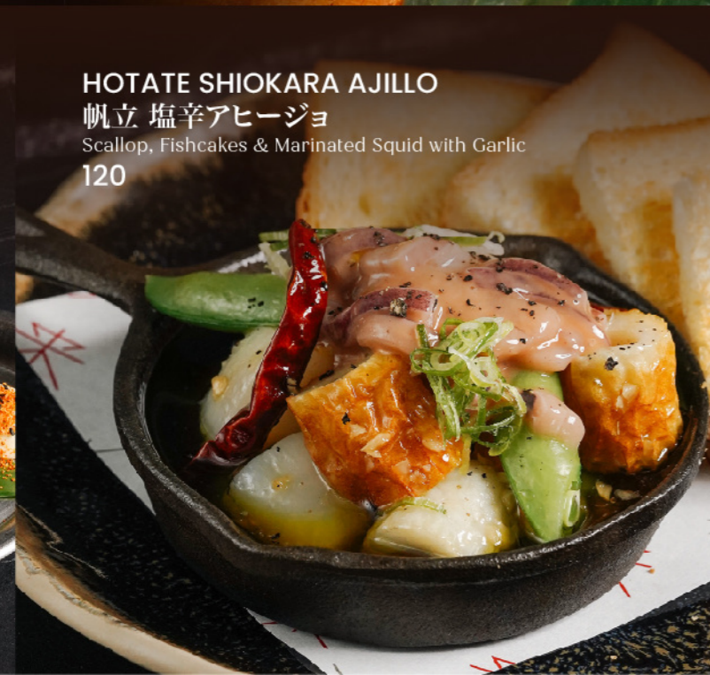
HOTATE SHIOKARA AJILLO 帆立 塩辛アヒージョ Scallop, Fishcakes & Marinated Squid with Garlic 120