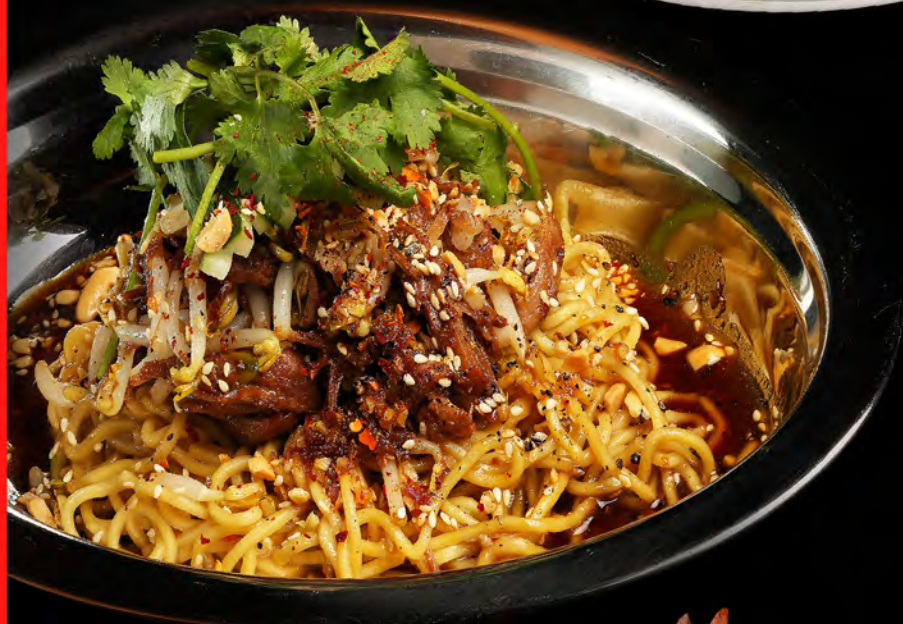
SPICY LAMB MAZESOBA DRY SOBA W/ SPICY LAMB 90