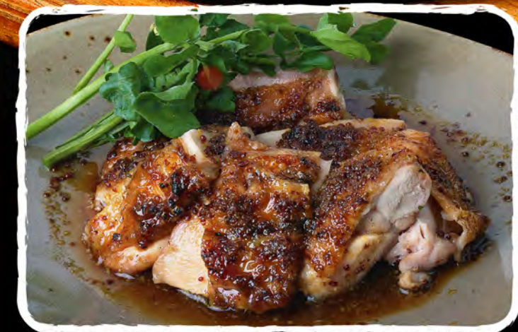
CHICKEN HONEY MUSTARD GRILLED CHICKEN W/ HONEY MUSTARD 70