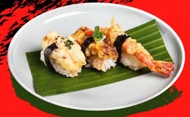
TENMUSU 3 KIND 80