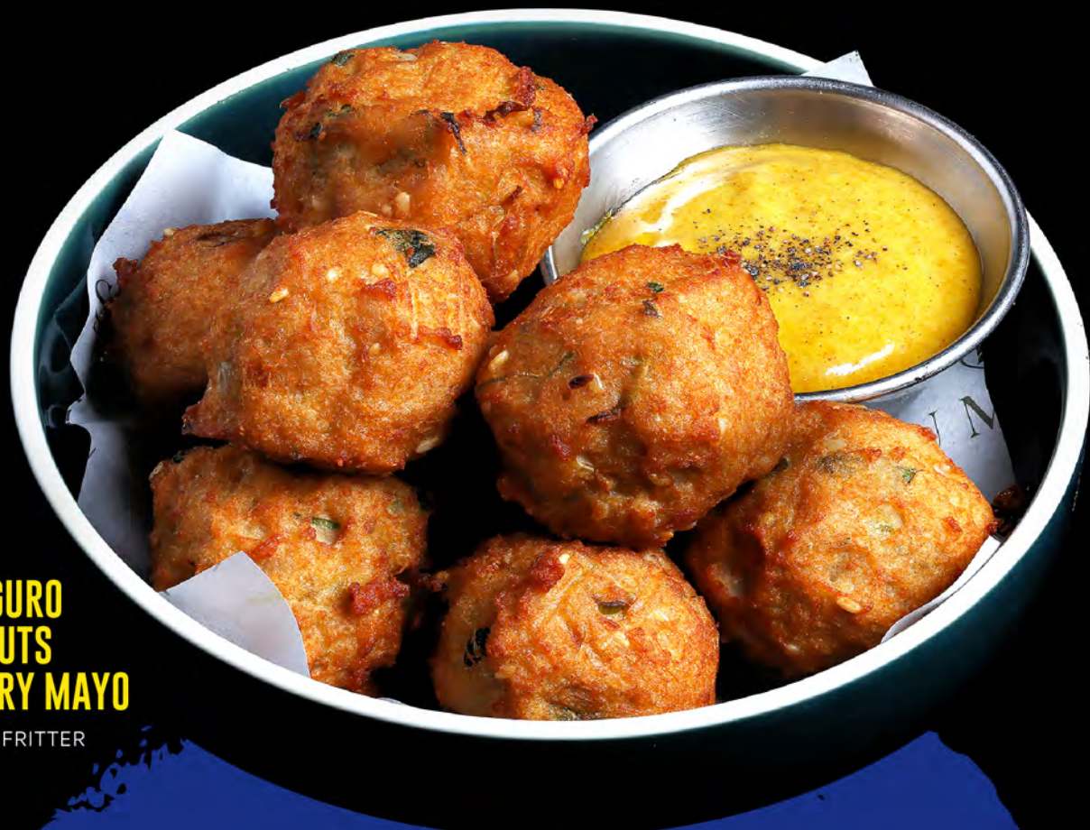
MAGURO DONUTS CURRY MAYO TUNA FRITTER