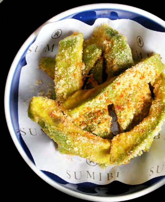
AVOCADO FRIES DEEP-FRIED AVOCADO W/ CHEESE