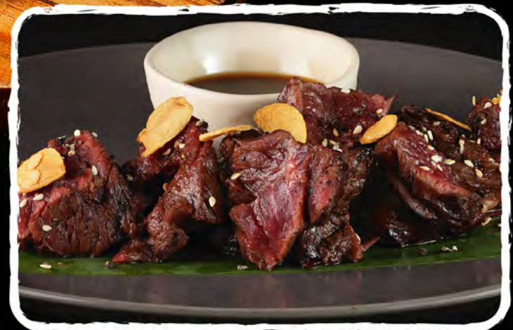
HARAMI GARLIC STEAK BEEF TENDERLOIN W/ HOMEMADE SAUCE 170