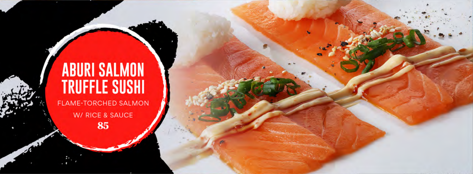
ABURI SALMON TRUFFLE SUSHI FLAME-TORCHED SALMON W/ RICE & SAUCE 85