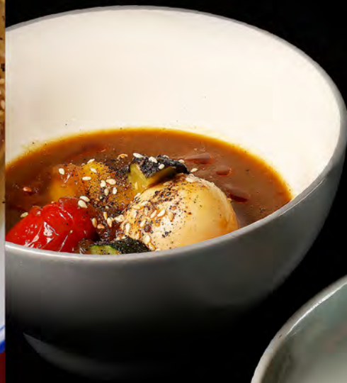
CURRY TSUKE SOBA DIP-STYLE SOBA W/ CURRY SAUCE 85