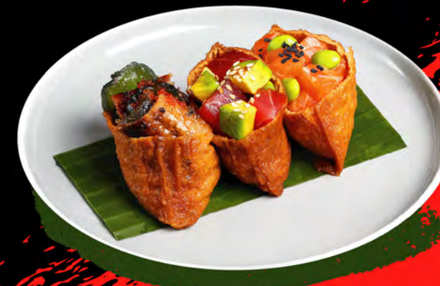
POKE INARI 3 KIND 80