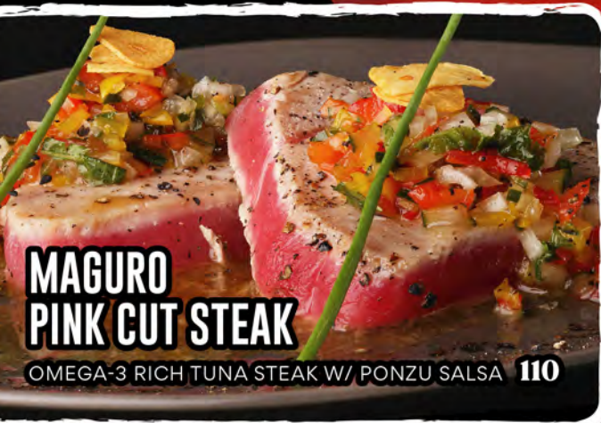
MAGURO PINK CUT STEAK

OMEGA-3 RICH TUNA STEAK W/ PONZU SALSA 110