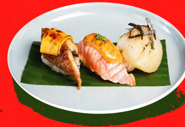
ABURI 3 KIND 80