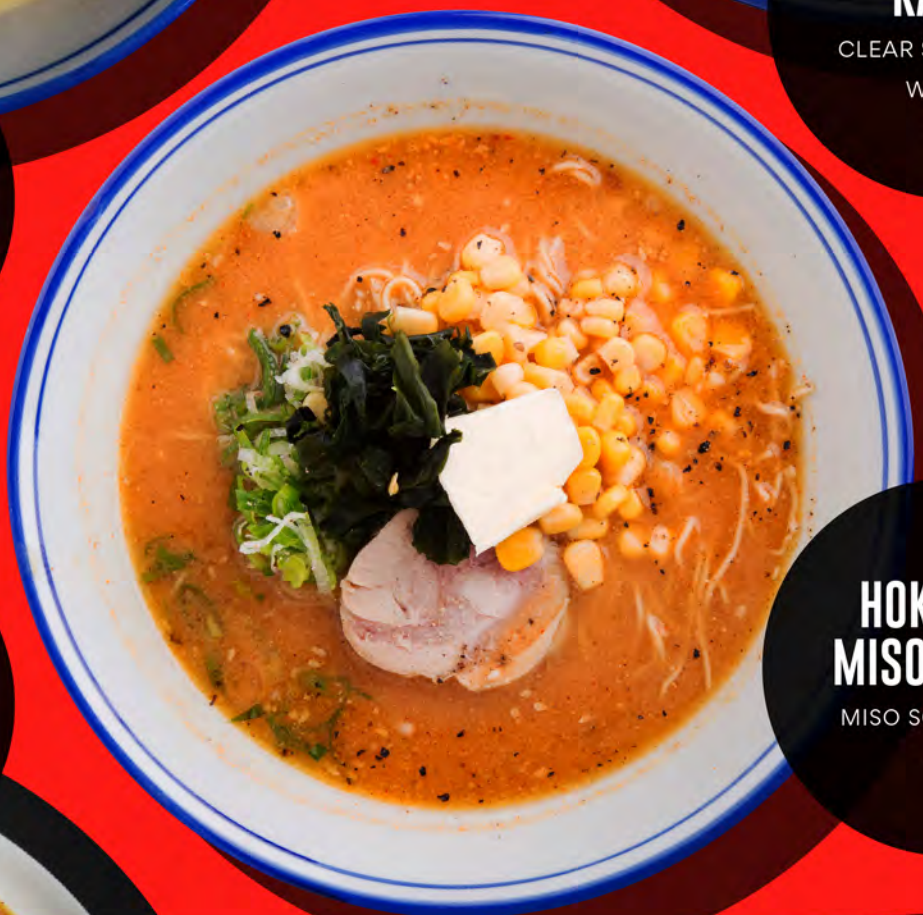
HOKKAIDO MISO RAMEN MISO SOUP RAMEN 80