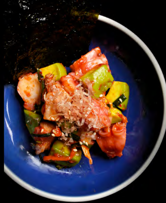
TAKO KIMCHI MARINATED OCTOPUS W/ KIMCHI & AVOCADO