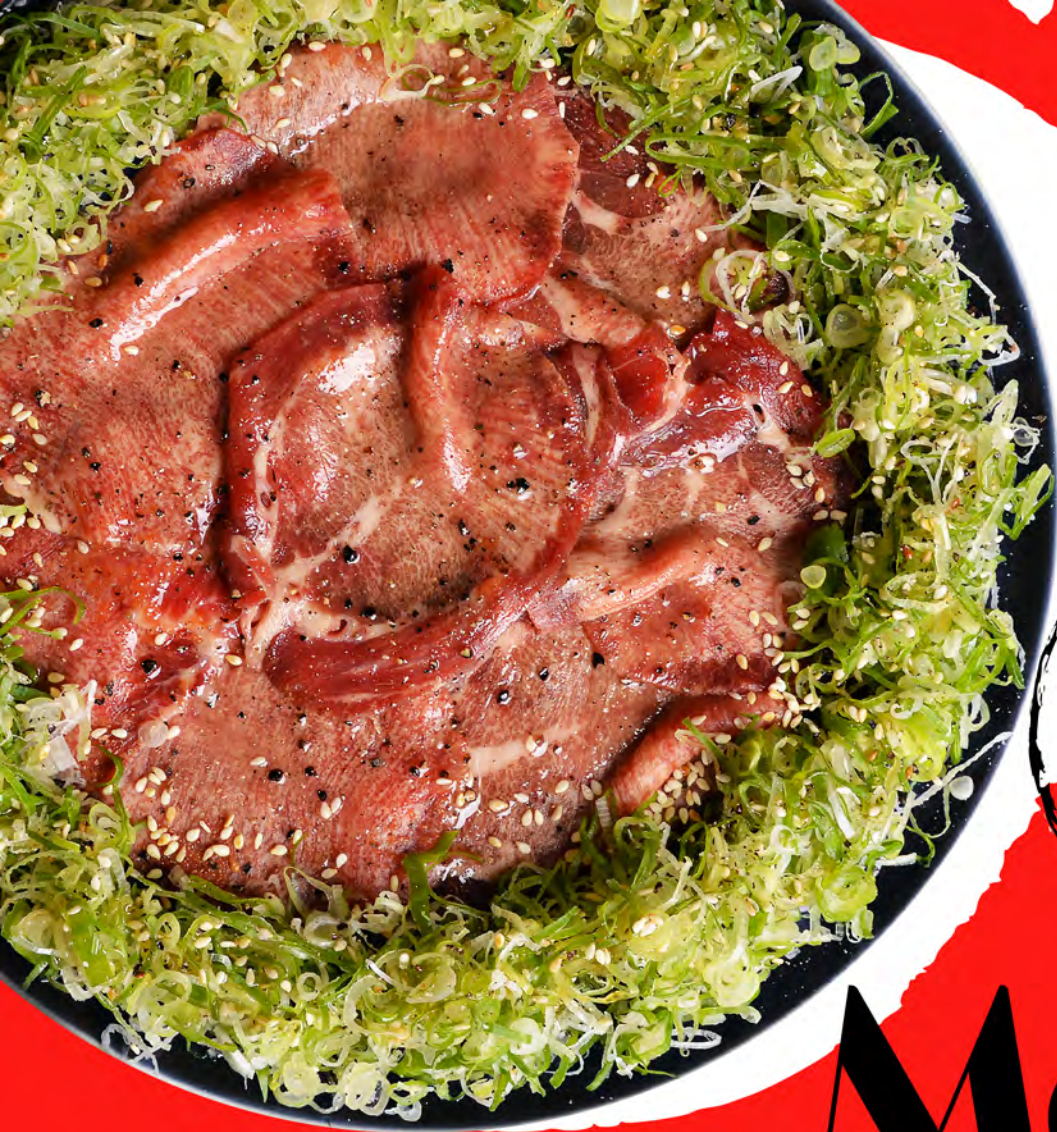
ABURI BEEF TONGUE CARPACCIO TORCHED BEEF TONGUE 140