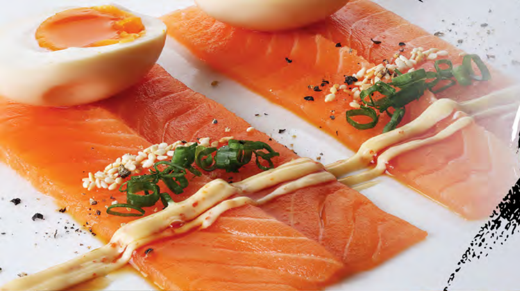
ABURI SALMON TRUFFLE EGG FLAME-TORCHED SALMON W/ EGG & SAUCE 85