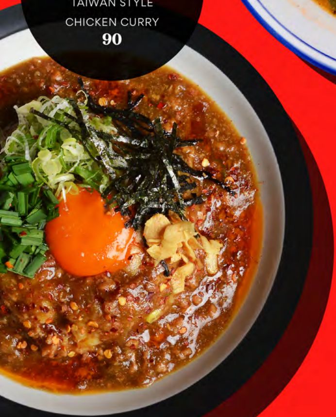
TAIWAN CURRY TAIWAN STYLE CHICKEN CURRY 90