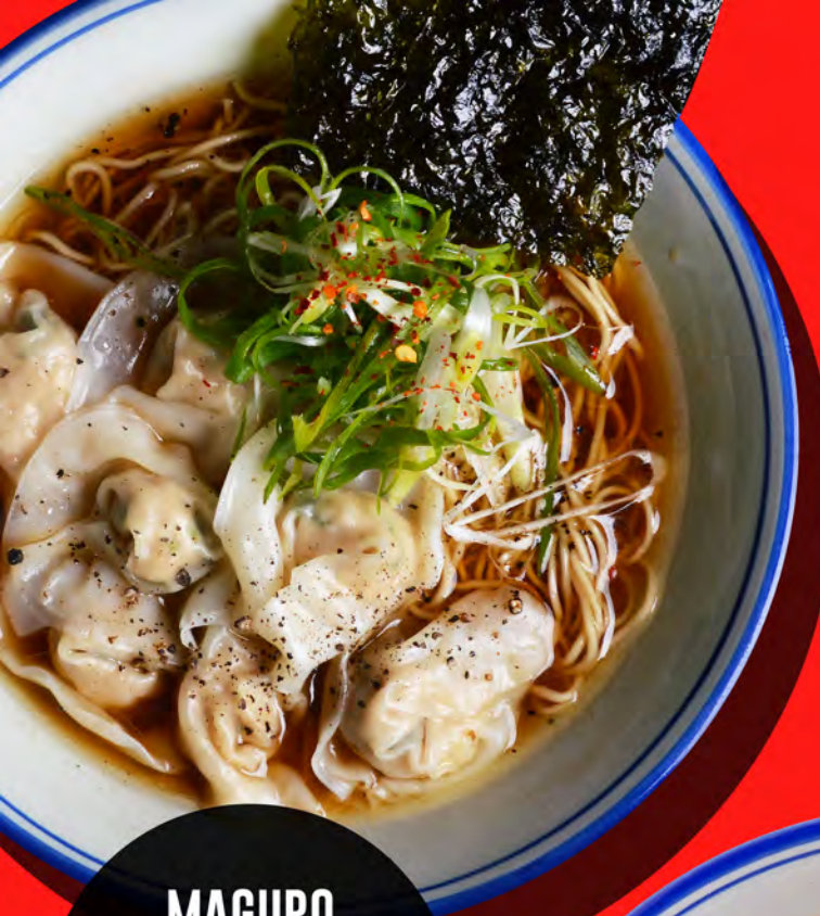
MAGURO WANTAN NOODLE TUNA RAMEN W/ STEAMED DUMPLING 90