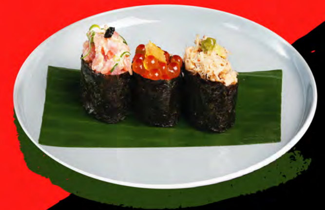
GUNKAN 3 KIND 80