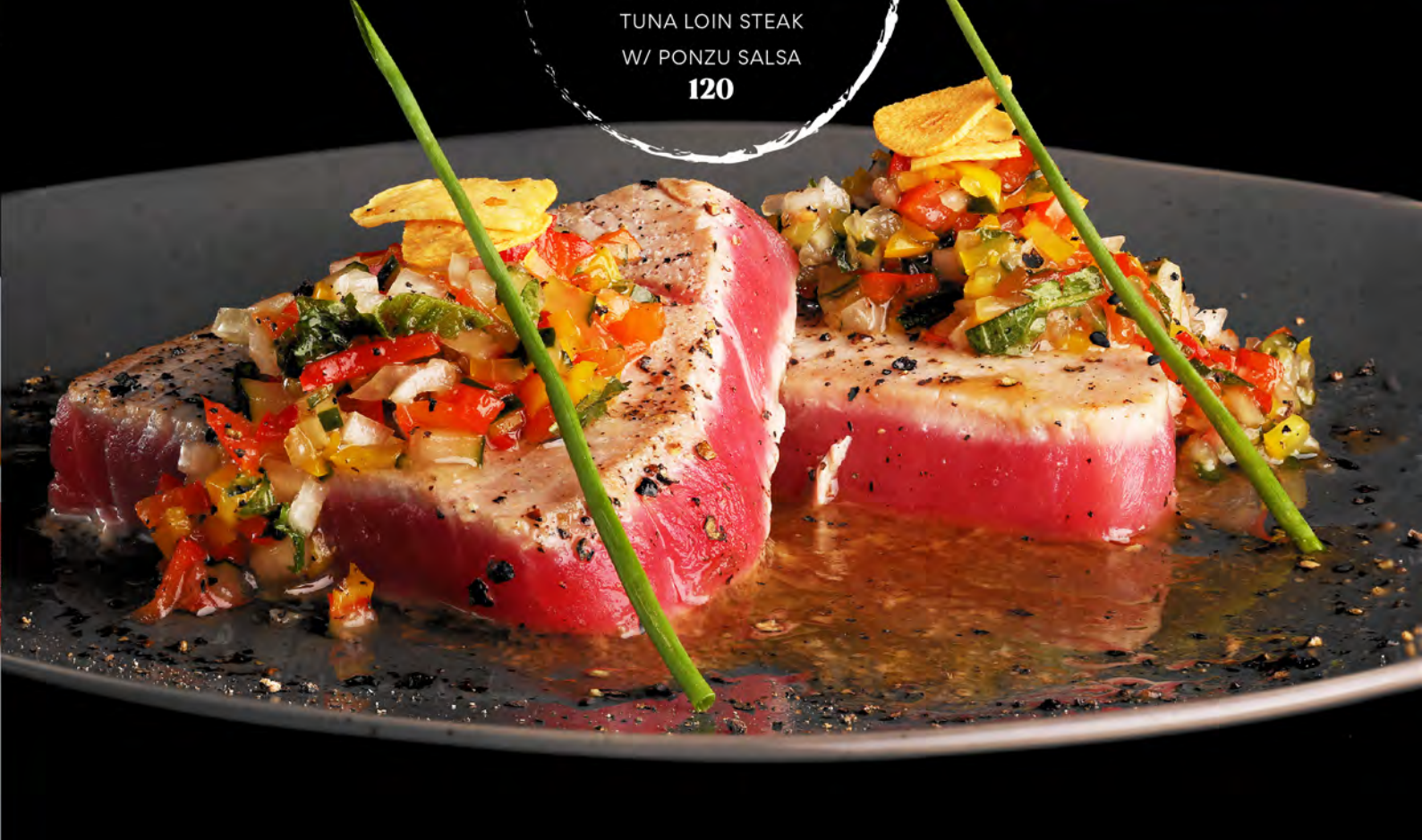
MAGURO PINK CUT STEAK OMEGA-3 RICH TUNA LOIN STEAK W/ PONZU SALSA 120