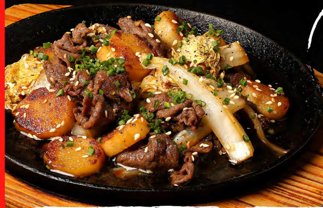
BEEF YAMAIMO BLACKPEPPER GRILLED BEEF W/ MOUNTAIN YAM 90