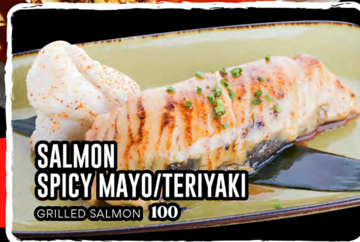
SALMON SPICY MAYO/TERIYAKI