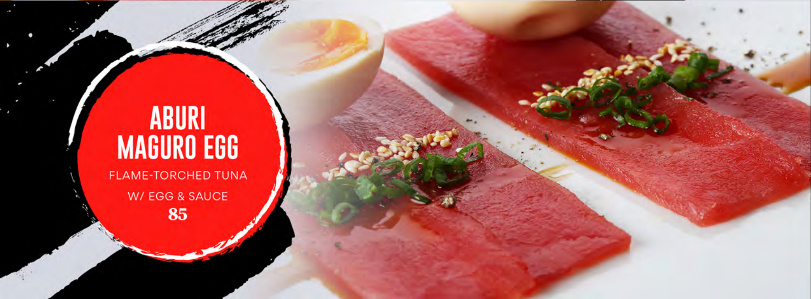
ABURI MAGURO EGG FLAME-TORCHED TUNA W/ EGG & SAUCE 85