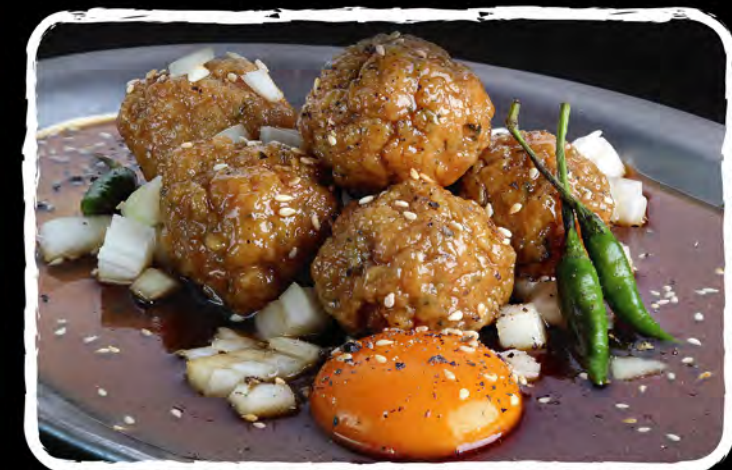
MEDAMA TSUKUNE GRILLED CHICKEN MEATBALL W/ EGG 70