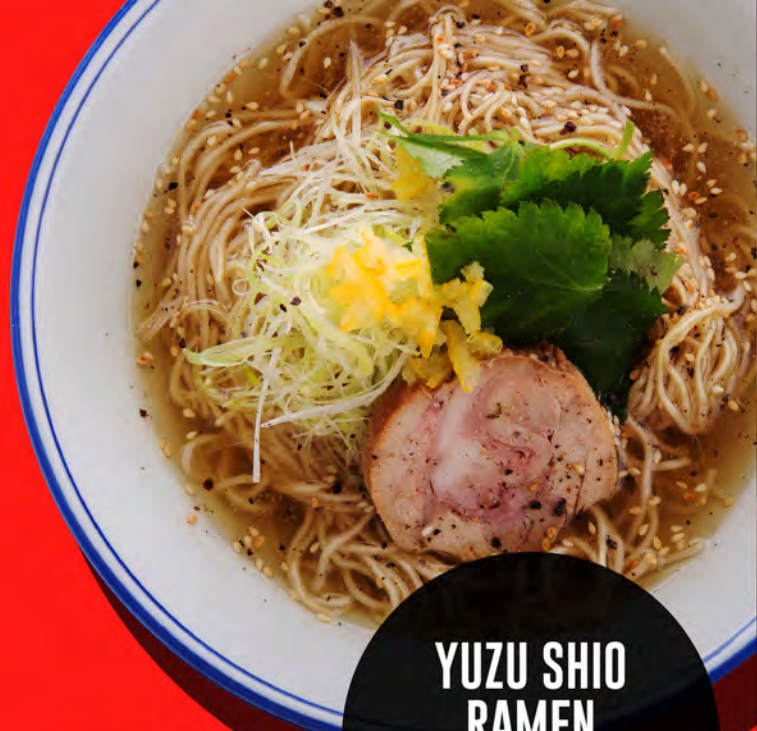
YUZU SHIO RAMEN CLEAR SOUP RAMEN W/ YUZU 80