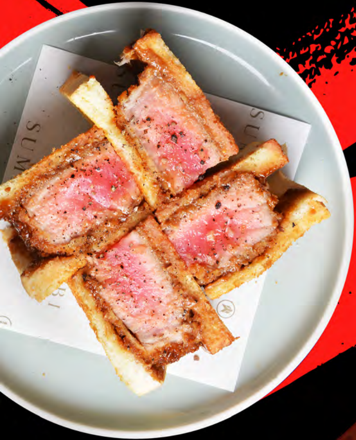
TUNA RARE KATSU SANDWICH