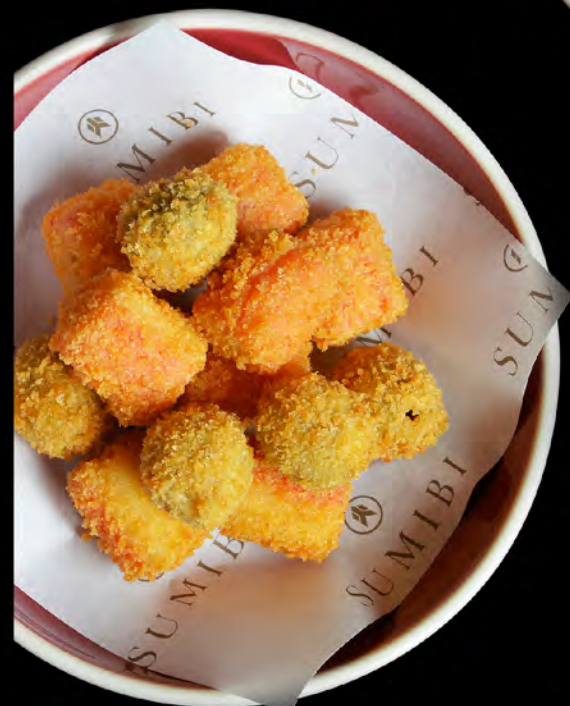
OLIVE KANIKAMA OLIVE & CRABSTICK FRITTERS