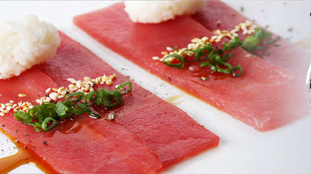
ABURI MAGURO SUSHI FLAME-TORCHED TUNA W/ SUSHI & SAUCE 85