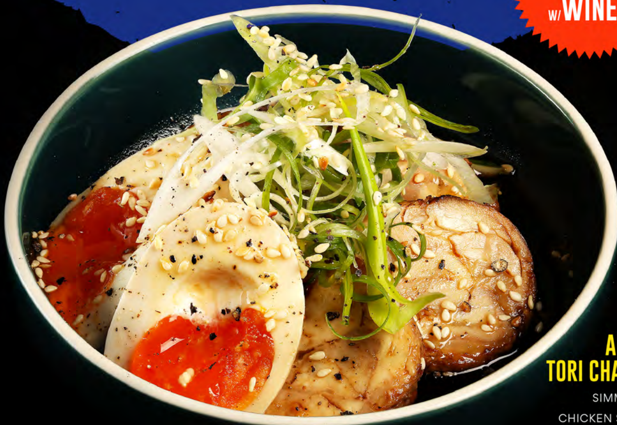
ABURI TORI CHASHU SIMMERED CHICKEN SLICES