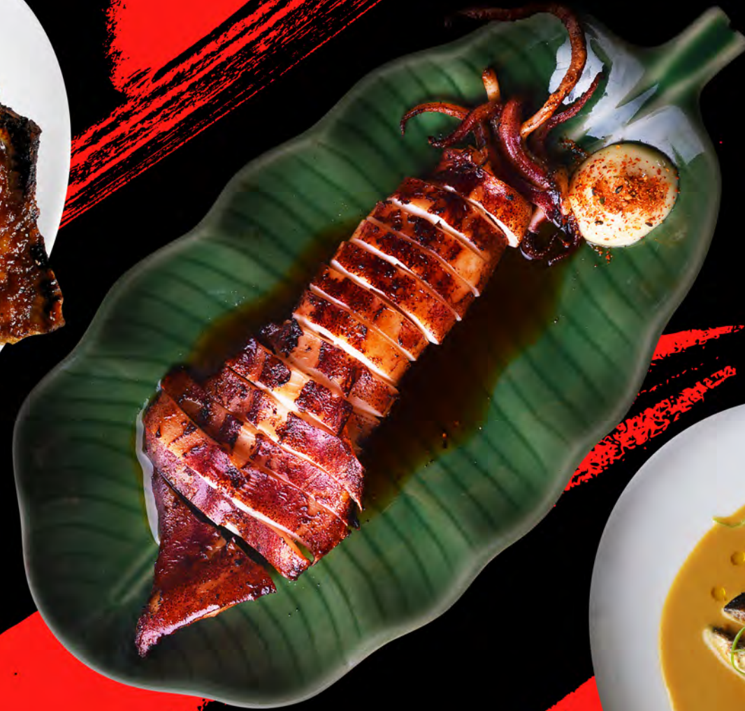
IKA MARUYAKI SHICHIMI MAYO

GRILLED TUNA COLLAR SUITABLE FOR 2-4 P 140