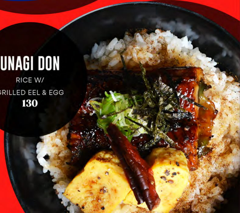
UNAGI DON RICE W/ GRILLED EEL & EGG 130