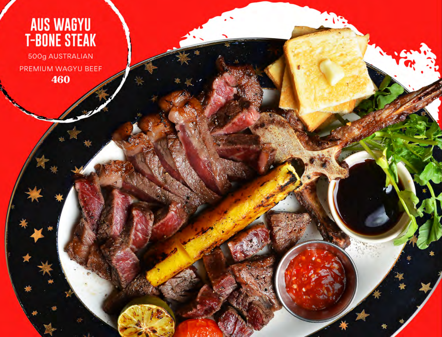
AUS WAGYU T-BONE STEAK 500g AUSTRALIAN PREMIUM WAGYU BEEF 460