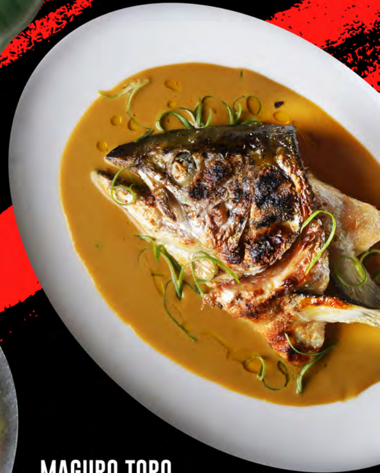
MAGURO TORO TERIYAKI GARLIC