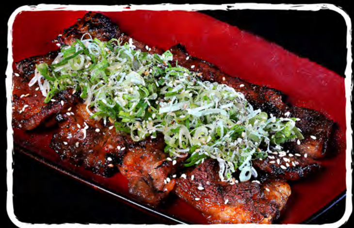
NEGISHIO KALBI GRILLED BEEF KALBI W/ MARINATED SCALLION 130